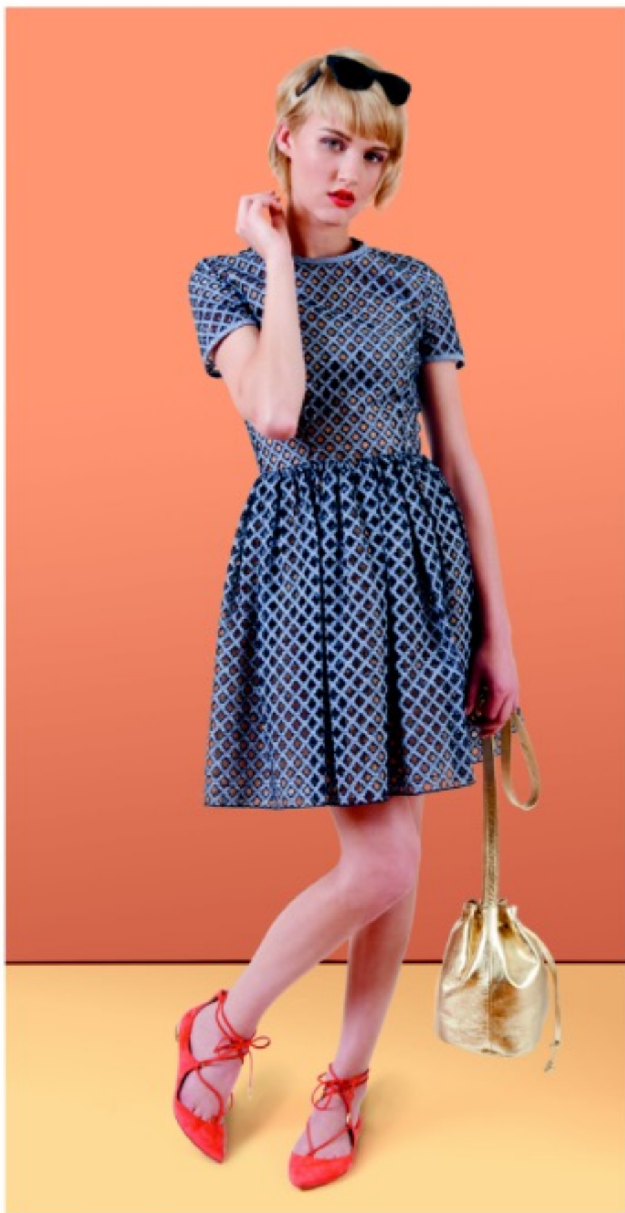
Dress, $1,595, shoes, $675, both at Mimi ; sunglasses, $350 at Mimi ; bag, $168 at Flying Fox ; picnic basket and pillows by Merienda .