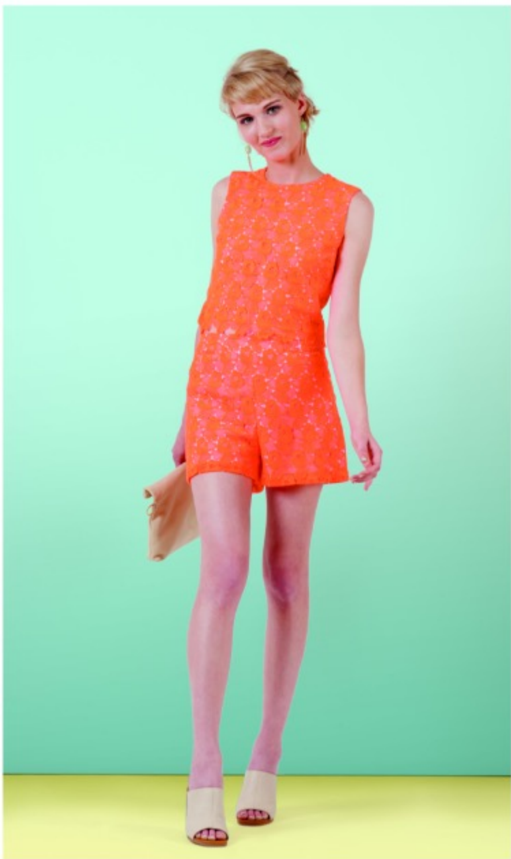
Top, $340, and shorts, $415, both at Angelique ; shoes, $315 at Emma's ; earrings, $32 at Lucy Rose ; bag, $235 at Flying Fox .